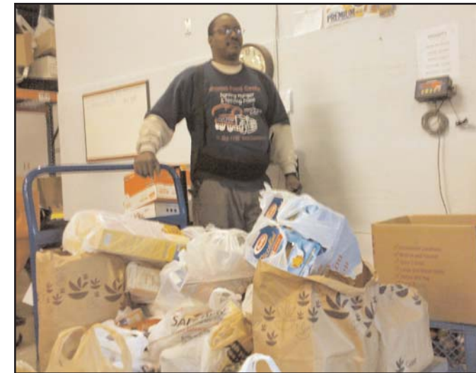
A Manna volunteer hauls in the 350 lbs. of food donated by MNCBIA members.

The first giving drive of the holiday season took place October 28 in Greenbelt at the Maryland-National Capital Building Industry Association's (MNCBIA) fall dinner meeting and awards night. That evening, HBCF collected approximately 350 pounds of food from association members and their guests. All food items collected were then donated to the Manna Food Center, the primary food bank in Montgomery County. Through their regular distribution program, Manna feeds about 3,300 families each month at 14 locations throughout the county. Hunger is a hidden, but prevalent problem in Montgomery County where one of every four county residents is at risk of hunger and 29.2 percent of all MCPS students qualify for a free or reduced price meal, an indication of the poverty we face daily in our community.