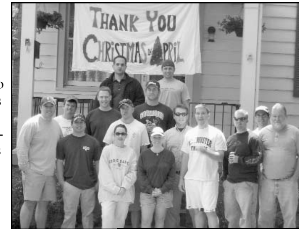
(Above) The team from NVHomes. (Right) Timberlake's "Extreme Makeover Team."

For the past 20 years, members of MNCBIA have generously contributed building materials, sponsor funds, and most importantly "hands-on" labor in support of the annual Rebuilding Together / Christmas In April (CinA) program throughout the entire Maryland-National Capital Area. CinA is a non-denominational volunteer organization with a mission to preserve and revitalize homes of low income, elderly, or physically challenged individuals. The program culminates with a National Rebuilding Day on the last Saturday in April. This year, in Prince George's County, over a half dozen MNCBIA members graciously stepped up to "adopt a house." Here are some of their stories.