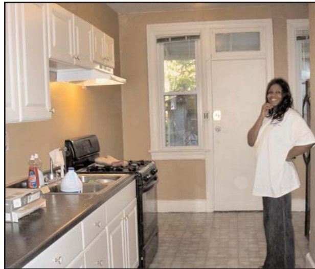
The happy homeowner admires her new cabinets.

Homebuilders—Giving Back To The Community With Compassion And Caring