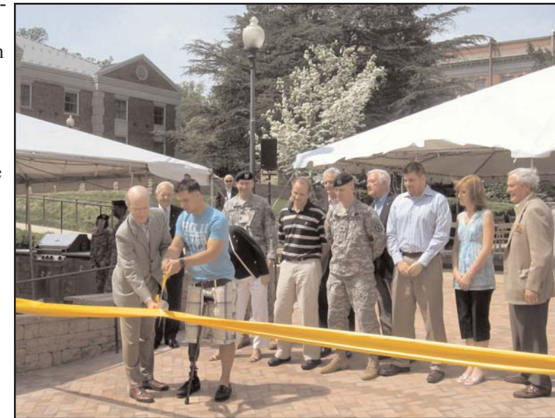
(Above) Secretary of the Army Peter Geren assists a wounded soldier at the ribbon cutting for the new Mologne House Courtyard.

Every day, our country's wounded servicemen and women return from combat, many to long-term rehabilitation at Walter Reed Army Medical Center. The family members of our wounded warriors often stay at Walter Reed's Mologne House Hotel for months at a time while their loved ones receive specialized care.