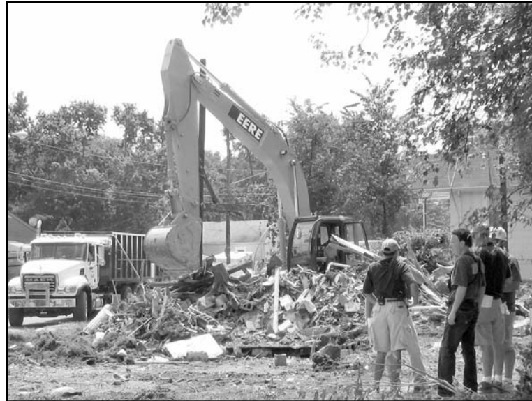
Day one of the Extreme Makeover build saw the small, two-bedroom house demolished in a matter of hours.